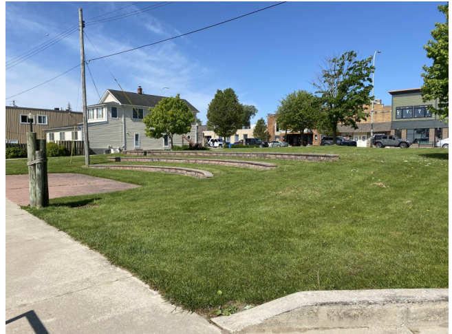
Corwin M. Drake Memorial Park - 401 South Water Street