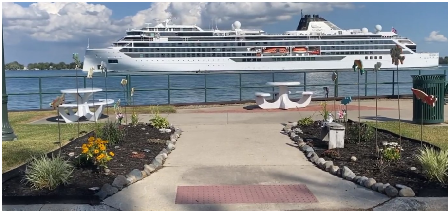
Jefferson Street End - Water Street & Jefferson Street