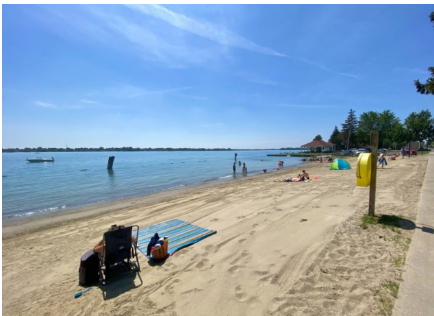
Marine City Public Beach - 200 North Water Street