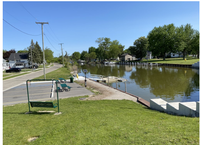
Marine City Kayak Launch - 725 South Belle River