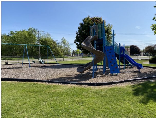
Ward Cottrell Park - 601 Ward Street