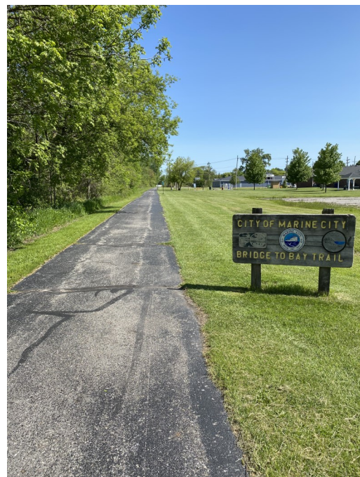
Bridge to Bay Trail System