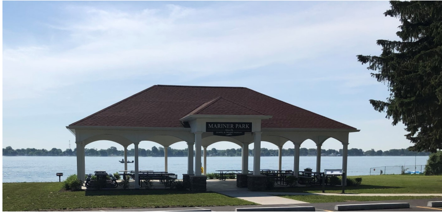
Mariner Park Pavilion - 134 North Water Street