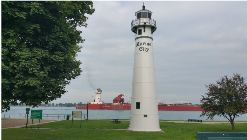
Lighthouse Park - 303 South Water Street