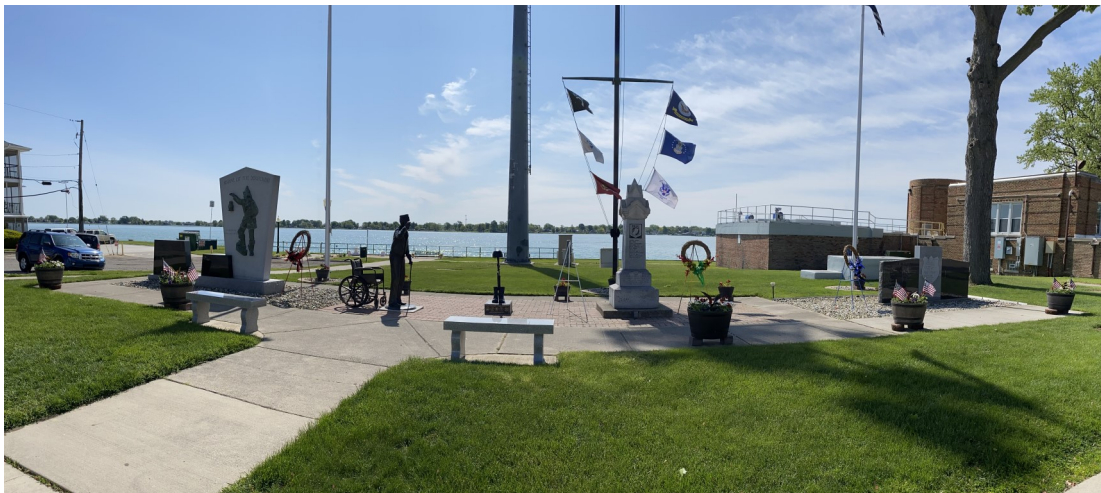
Water Works Park - 229 South Water Street