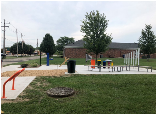
Musical Parklet - 300 South Parker (Behind the Marine City Library)