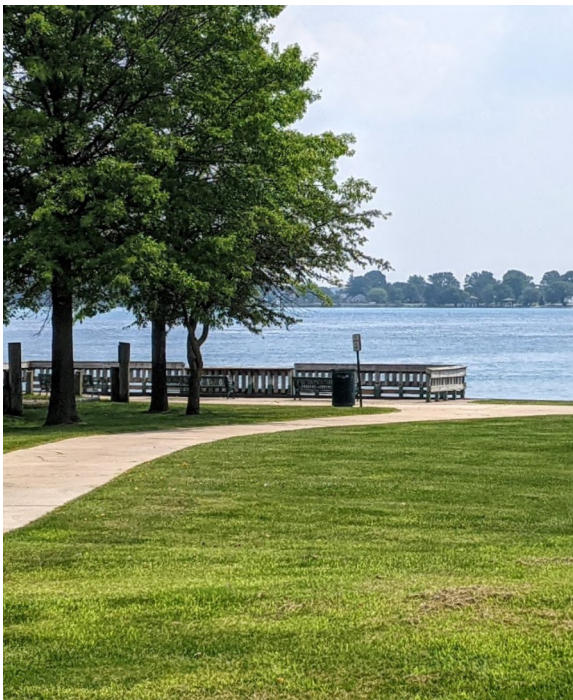
St. Clair Street End - Water Street & St. Clair