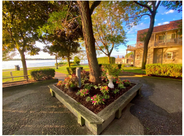
Marine City Civic Women's Club Park - South Water Street