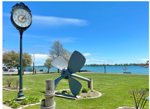
Nautical Mile Park - 477 South Water Street