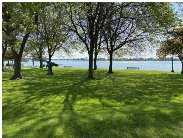
Broadway Park– 100 Broadway Street