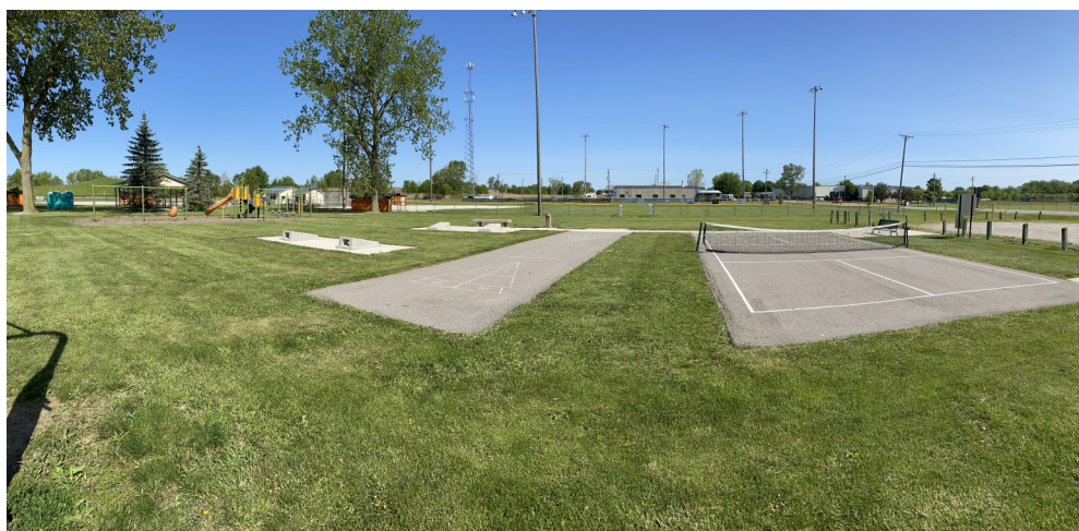
King Road Park - 6370 King Road