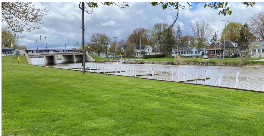
Marine City Marina - 610 South Main Street