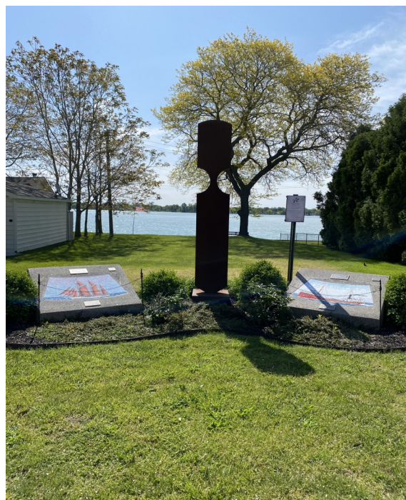
Watchman Park - 131 South Water Street