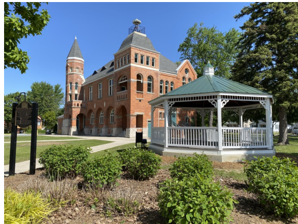
Heritage Park - 300 Broadway